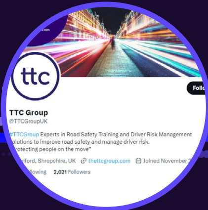
X (formally Twitter)