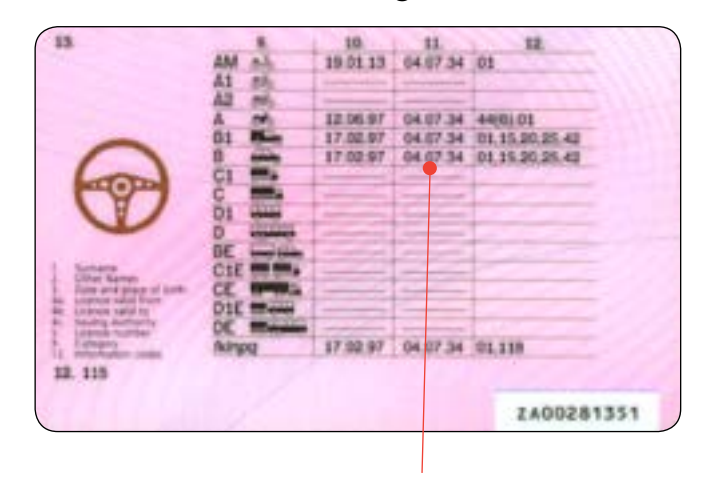
Expiry date of entitlement