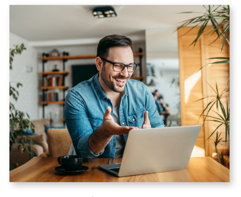
Trainer Focus Forum Sessions

For further information please go to https://www.autism.org.uk