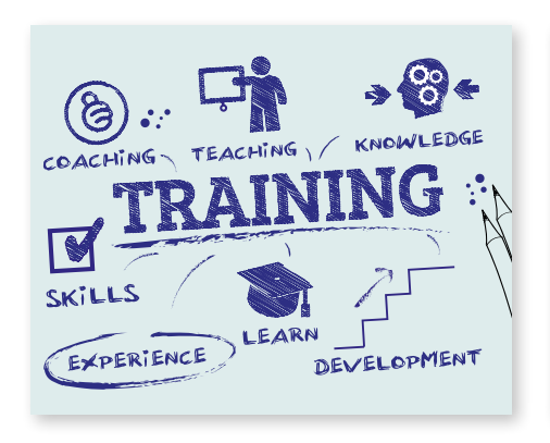
Training & Opps